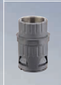
Gaines annelées ROHRflex